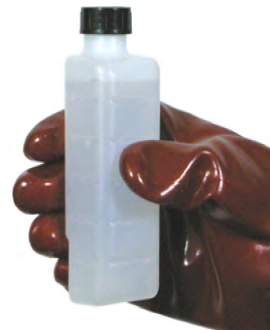
Safe transport of sealed bottle to the beeyard

With the three wick sizes available the evaporation rate can be adapted to the size of the hive. On the surface of the U-wick acid is additionally evaporated. Thus, the amount of acid is balanced in rather active colonies of bees, while it usually „blows out“ by strong fanning through the entrance hole. This is not possible in comparable competitive models.